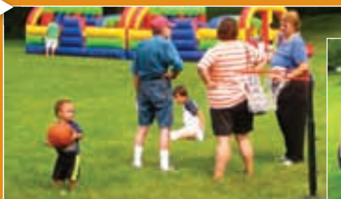
Playing games and taking pictures with Moola made our Kids' Club party special!