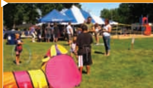
Unison was a proud sponsor of the kid's games for Festival on the Fox in Wrightstown again this year!